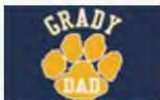
Grady Dads T-Shirts Cost is $15 per shirt